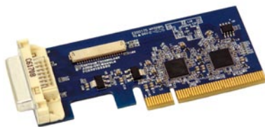
ADD2-DVI-Dual Part # 820952