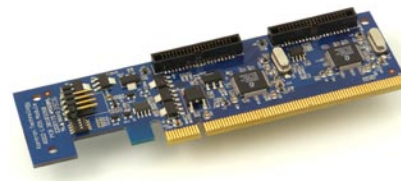
ADD2-LVDS-Dual Part # 820950